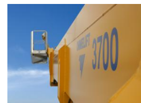
180° Basket turn